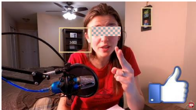
Result of hybrid model