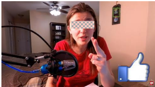
Result of hybrid model w/ MT