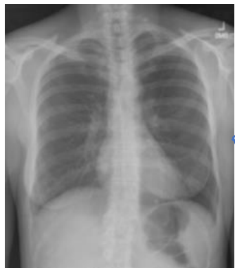
Chest X-Ray Image