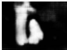
Auxiliary saliency detection task