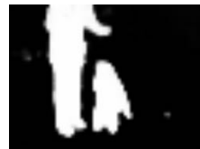
Updated saliency PGT