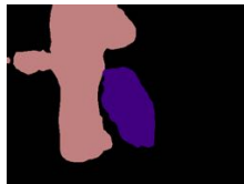
Primary semantic segmentation task