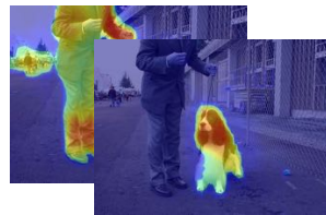
Refined CAM maps