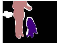
Updated semantic PGT