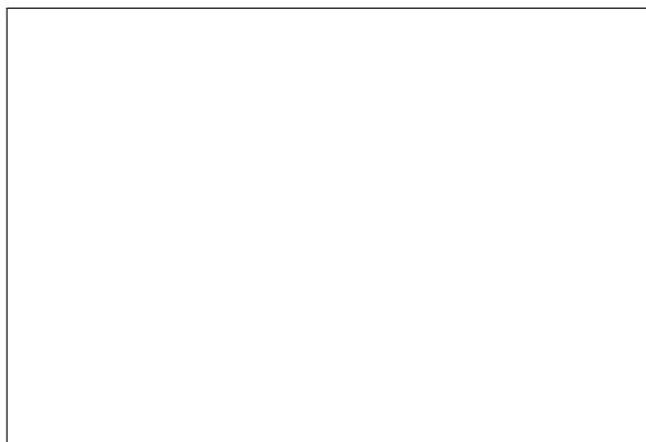
Figure 1. Example of caption. It is set in Roman so that mathematics (always set in Roman: B \sin A = A \sin B ) may be included without an ugly clash.