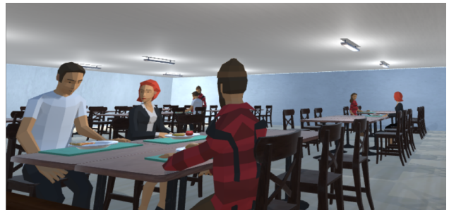
Figure 1: Virtual cafeteria environment.

In ongoing work [Brännström et al., 2020], we model a rational intelligent agent that plans its actions for encouraging a human to act in a social virtual reality (VR) environment (see Figure 1 [Brännström et al., 2021]).