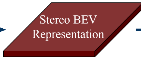
Stereo BEV Representation