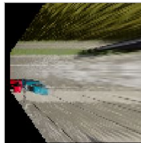
Inverse Perspective Mapping