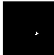
MoCo-v2 (F1 = 2.62)