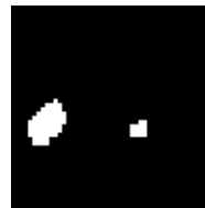
MoCo-v2+TP (F1 = 34.69)