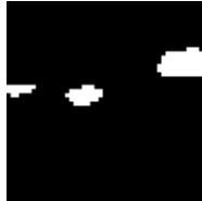
Random init. (F1 = 26.62)