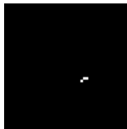
Random init. (F1 = 1.58)