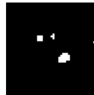
ImageNet (F1 = 19.71)