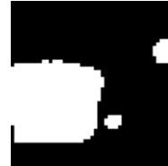
SeCo (F1 = 84.25)