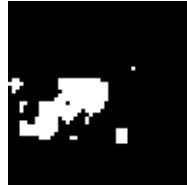
ImageNet (F1 = 45.81)