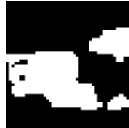
MoCo-v2 (F1 = 79.00)