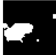
MoCo-v2+TP (F1 = 61.45)