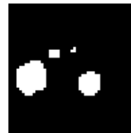
SeCo (F1 = 61.89)