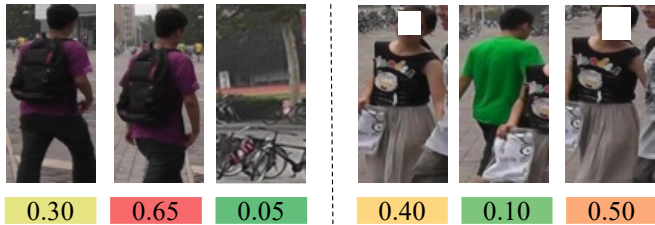
(b) Temporal attention.