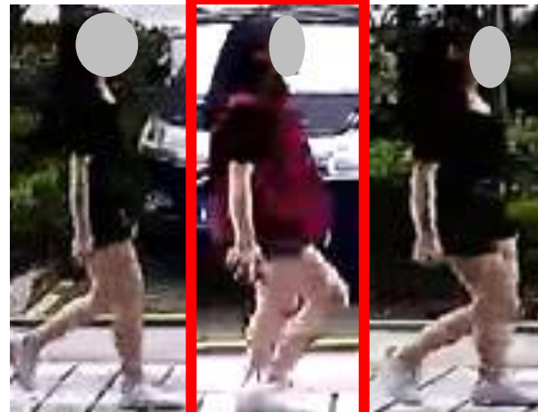
Same person, different clothes