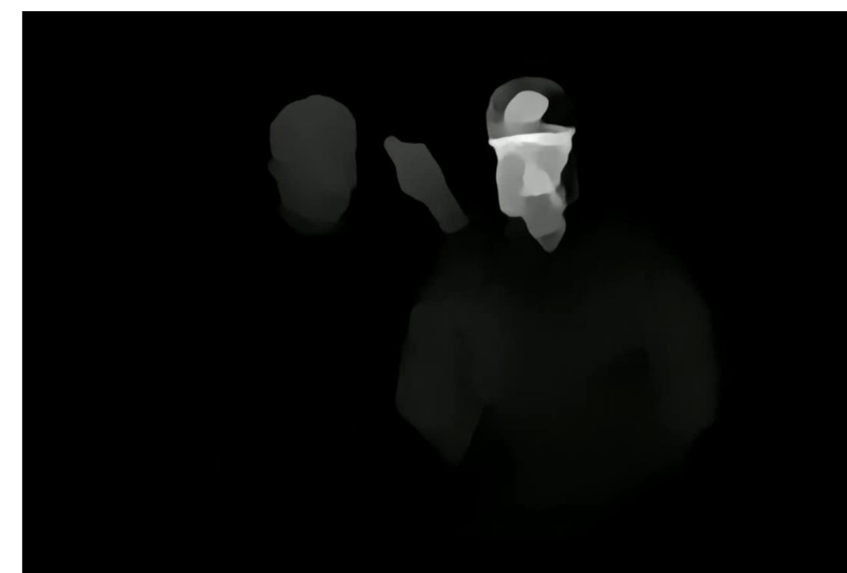
(b2) Optical flow maps