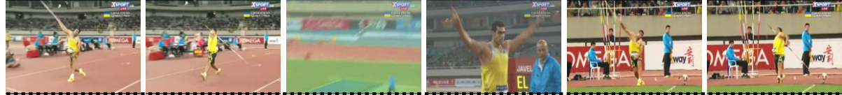
(a) The man with a yellow vest is throwing a javelin.