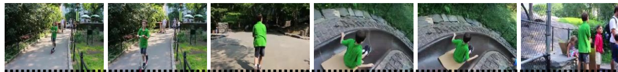
(b) A boy is riding a scooter./ A boy in green is sliding down a slideway.