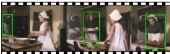
(a) Current Works