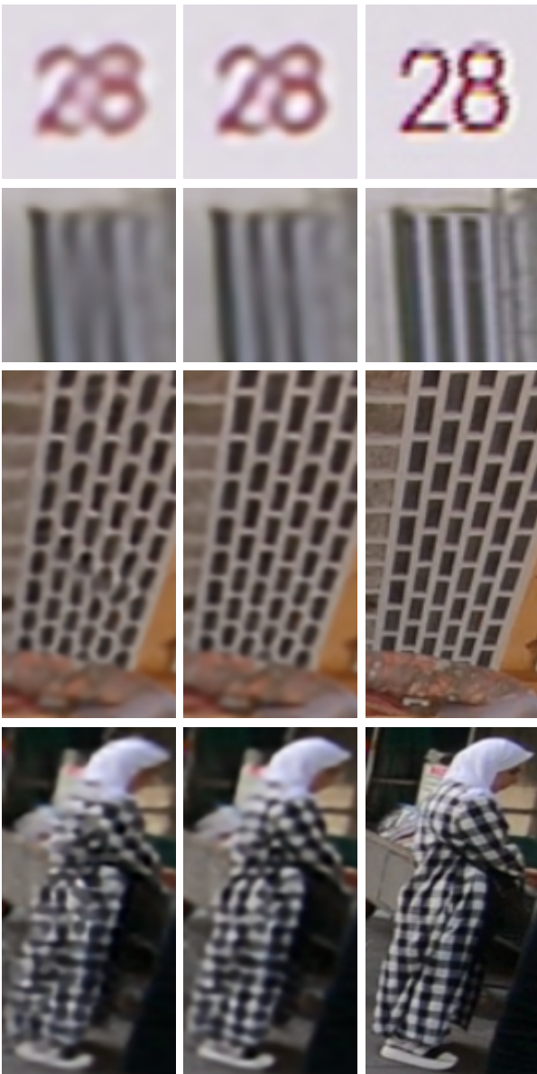
TOFlow (Pre-trained) TOFlow (Adapted) Ground Truth