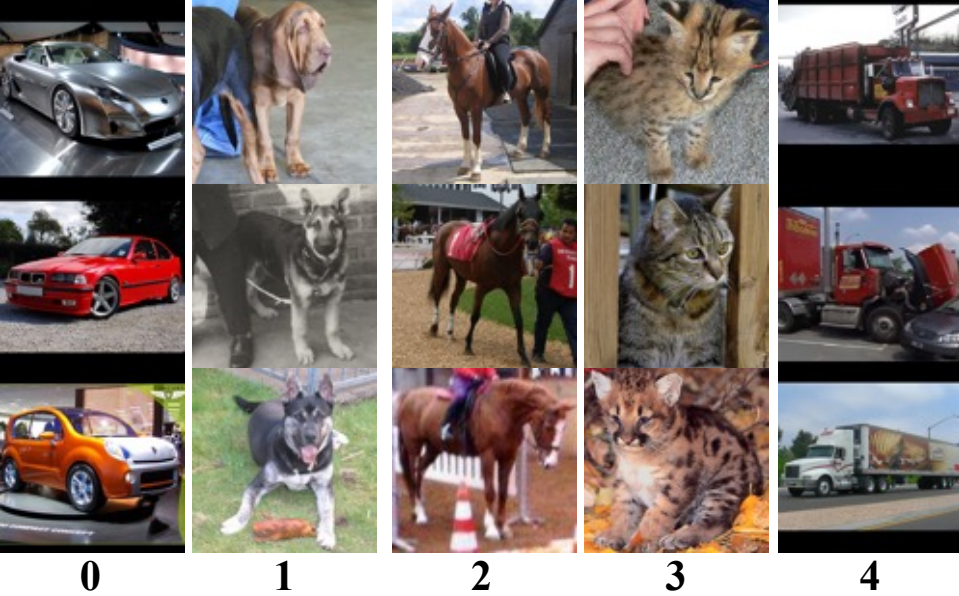
(a) Nearest samples to prototypes