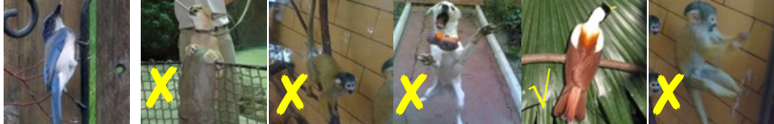
(a) Semantic inconsistency of nearest samples.