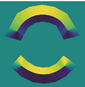
(c) \sin \theta