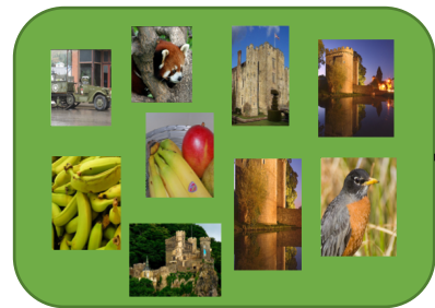
The whole unlabeled set X_U