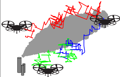
Distributed Dispersion Detection