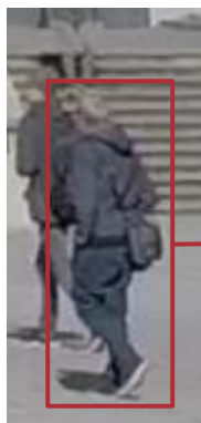
Query object at frame t