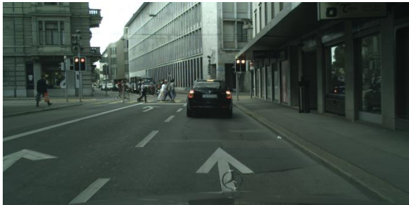
(a) Original training data