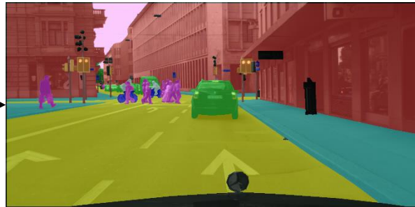
(b) Augmented training data