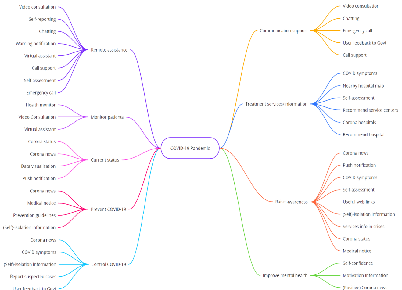
FIGURE 2. Mind map of the features and objectives of the apps

The review comments were independently analyzed by two researchers. The comments were meticulously read to notice, and code as we discussed above. The assigned key-