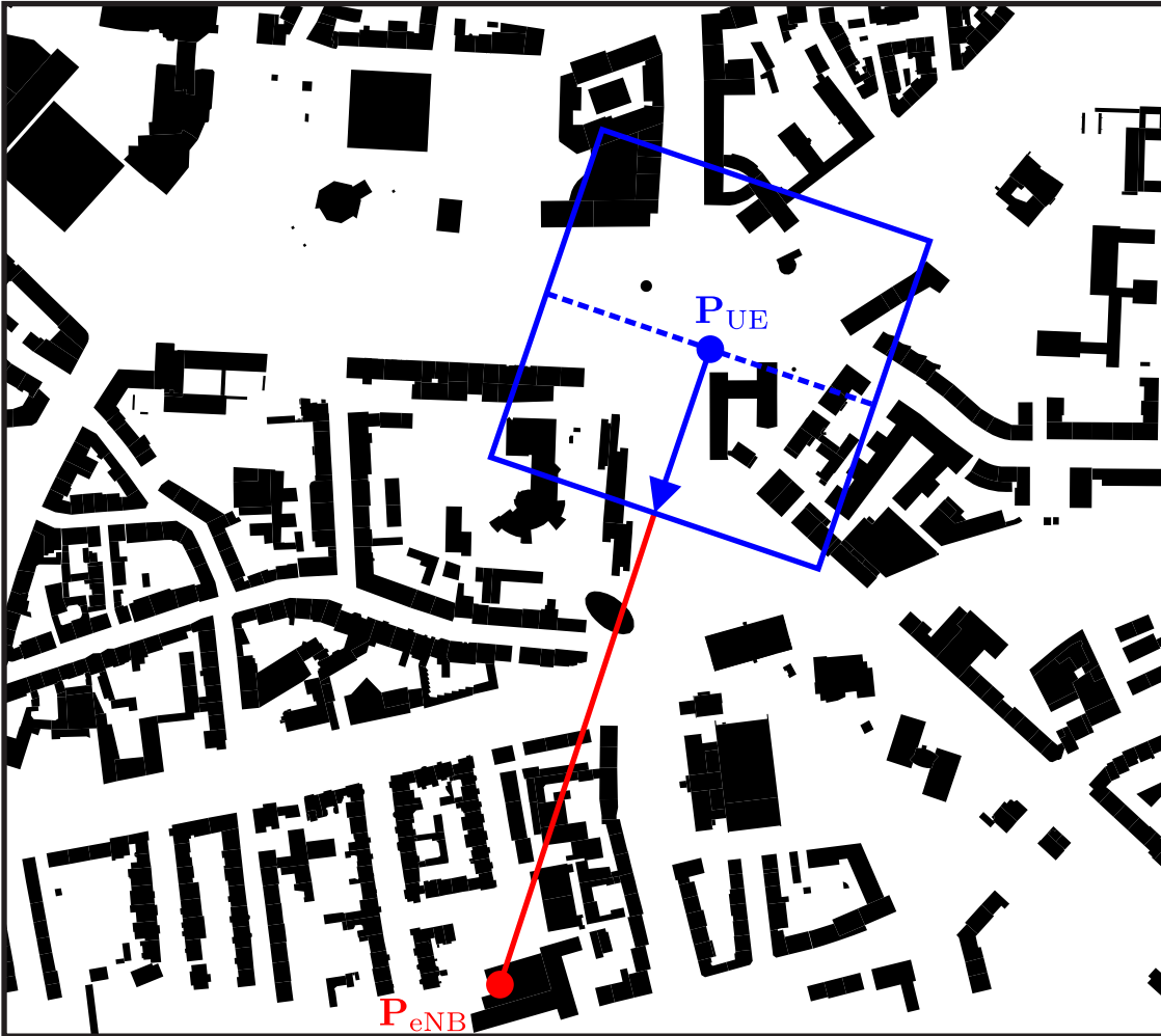
1) Determination of the Region of Interest (RoI)