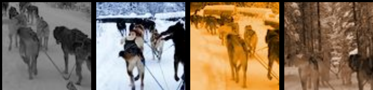
Frame-level spatial augmentation