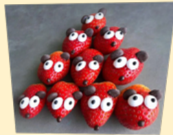
(e) Failed Perspective Correction