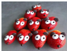
(a) Input Image