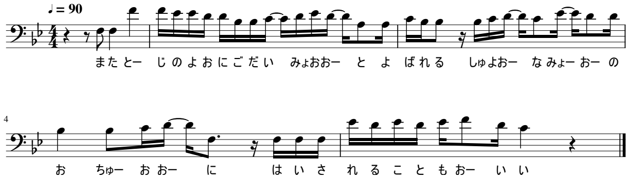
Figure 3: Score of PJS100.001.xml. The lyrics are “mata tooji no yoo ni godai myoooo to yobareru shuyoo na myoooo no chuuoo ni haisareru koto mo ooi.” Most (but not all) individual notes correspond to a single syllable. Some notes correspond to multiple syllables, such as to-o-ji on the first musical bar and myo-o-o-o on the second musical bar, where “-” indicates the syllable boundary.