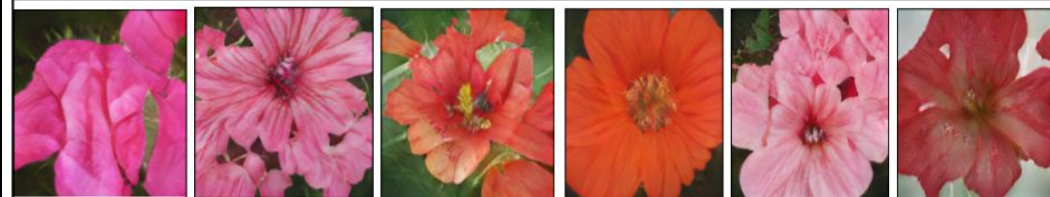
Mexicanaster Morningglory Bromelia Rose Bromelia Hibiscus

Text: Flower with white petals yellow at center, wrap around yellow stamen