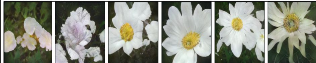
Bearded iris Bearded iris Moonorchid Silverbush Silverbush Windflower

Text: Flower with white petals yellow at center, wrap around yellow stamen