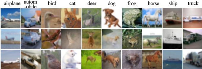
Original raw images