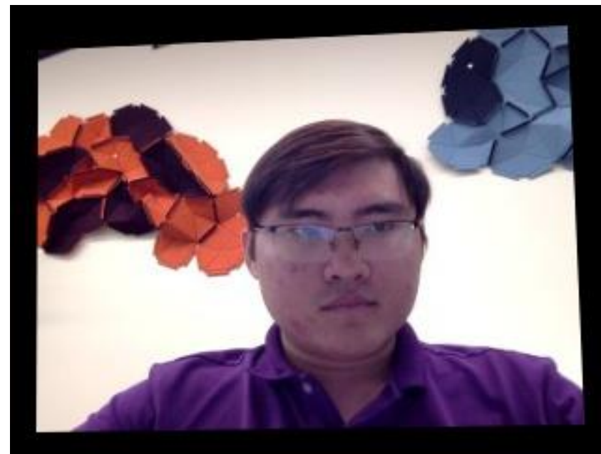
Aligned projector content