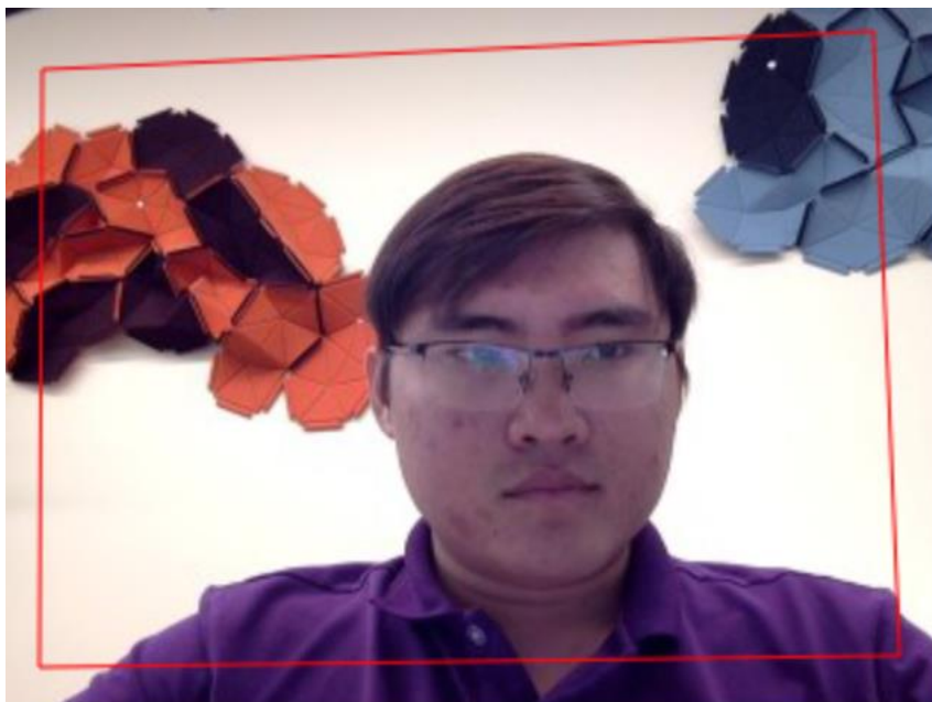
Camera view point