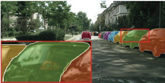
Mask R-CNN + 4×conv