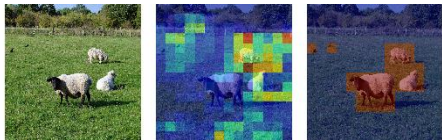
Q: How many animals are on the grass? A: 5