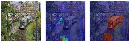
Q: Is the track going straight? A: No