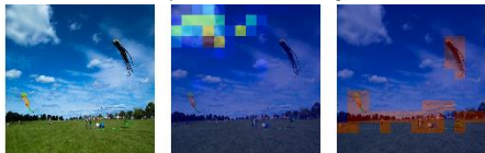
Q: Are there clouds in the sky? A: Yes