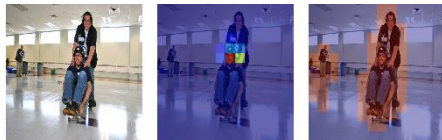
Q: What does this man have on his head? A: Helmet