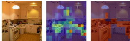
Q: Which room is this? A: Kitchen