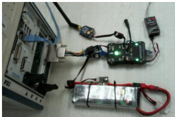
(a) Simulation Computer & Pixhawk