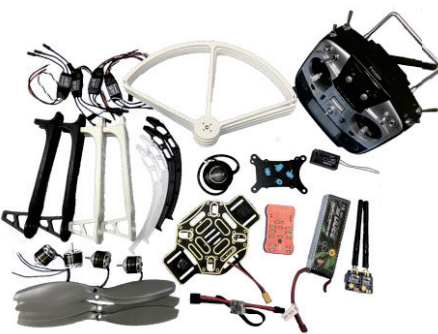
(a) F450 quadcopter components