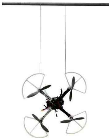
(c) Bifilar pendulum method for moment of inertia measurement