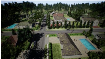
(b) Front Camera View from 3D Engine