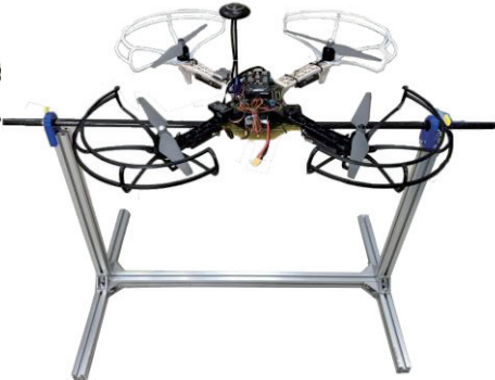
(b) Indoor test equipment for attitude response identification