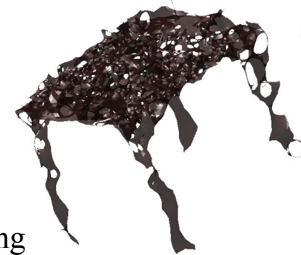
Floating Scale Surface Reconstruction