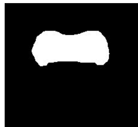
Visible Silhouette (Mask-RCNN Detection)