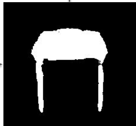
Predicted Complete Silhouette