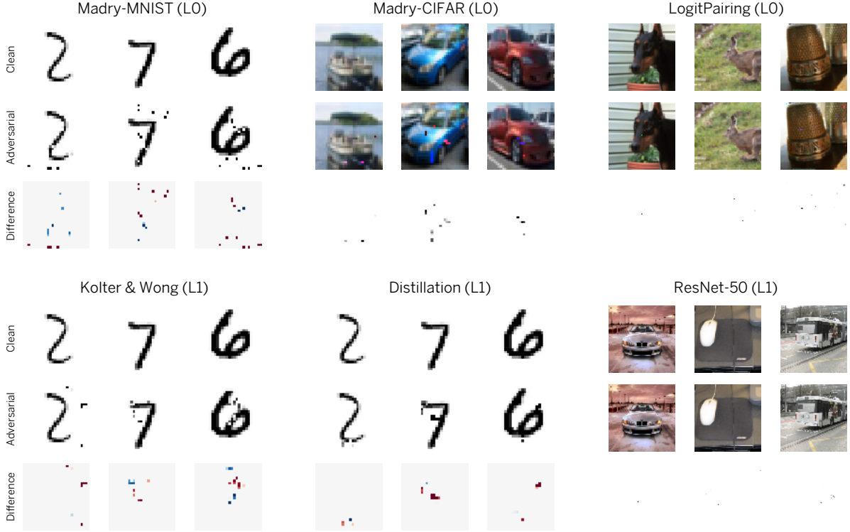
Figure 2: Randomly selected adversarial examples found by our L_0 and L_1 attacks for each model.