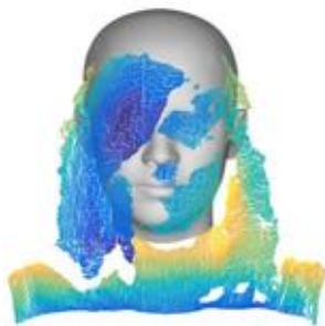
(e) RVC + ML