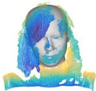
(g) RVS + PSO