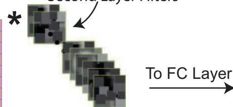
To FC Layer