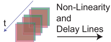
Pixels output sequentially in time.