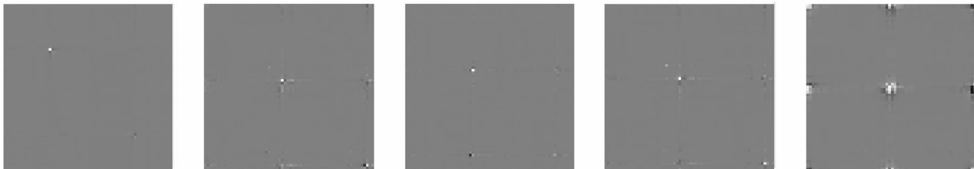
Estimated virtual channel covariance