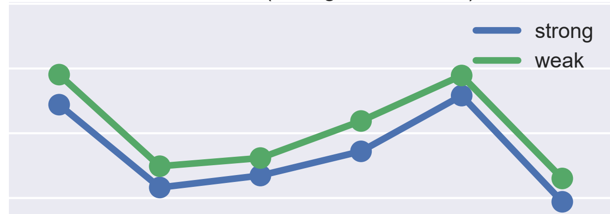
condition = (strong/weak, hover)