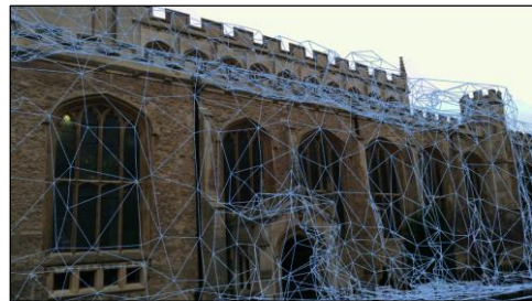
Test Frames with 3D Model Fitted (Our Results)