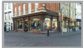
Training Set (2 Images Total)