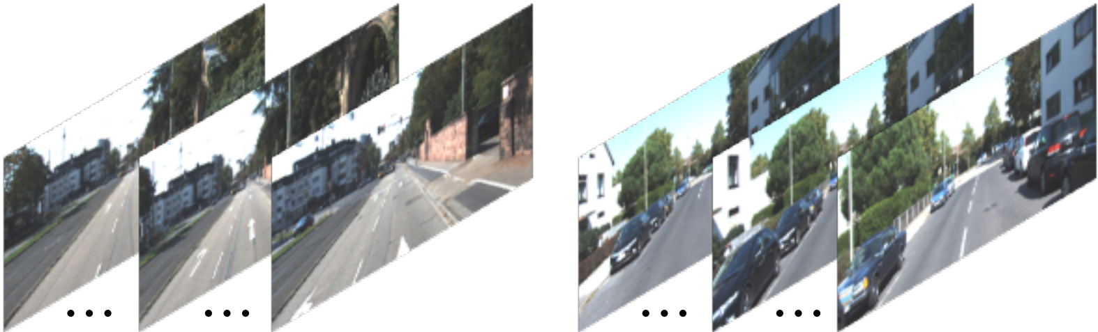
(a) Training: unlabeled video clips.