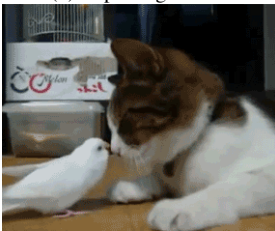
(b) Repeating Action