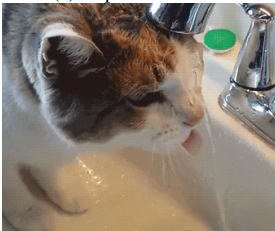
(a) Repetition Count