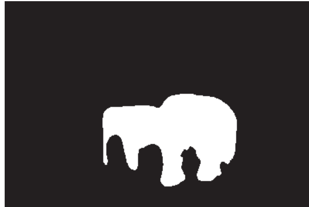
Salient region detection