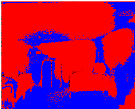
(a) Raw Depth Prediction