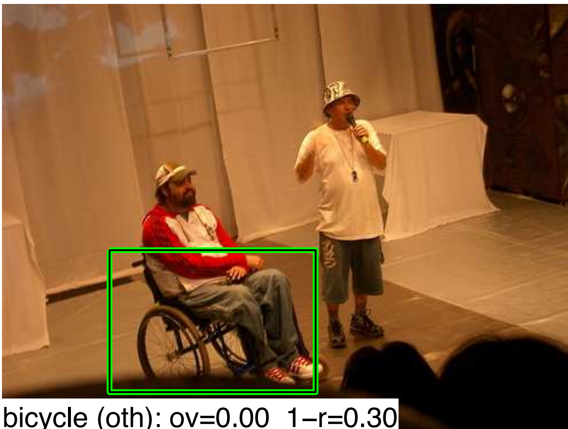
bicycle (oth): ov=0.00 1-r=0.30