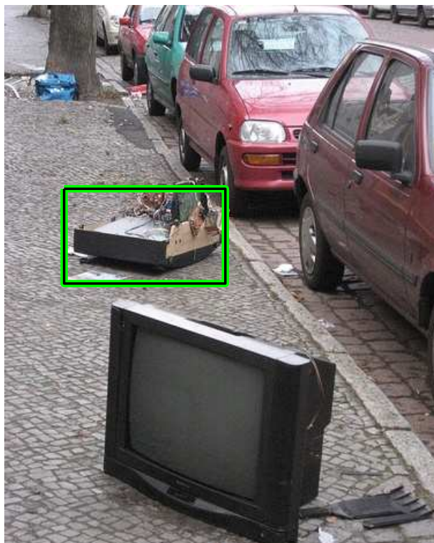
boat (bg): ov=0.00 1-r=0.65