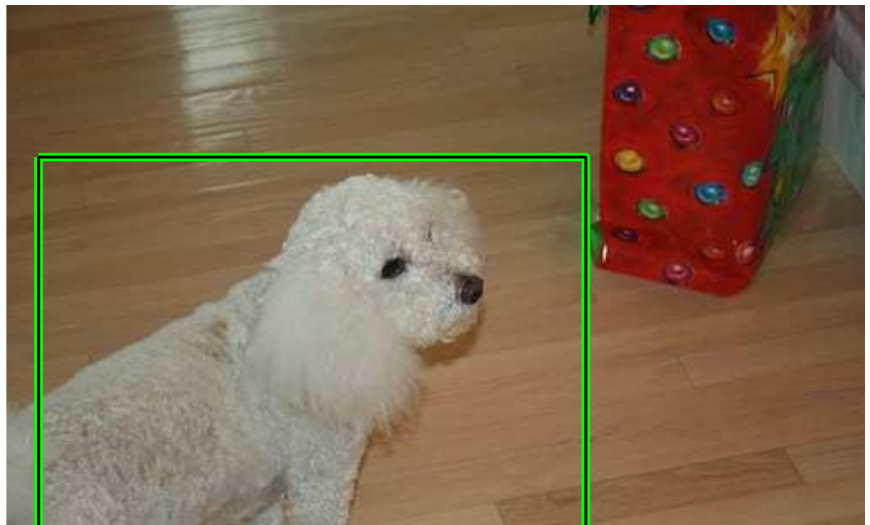
sheep (sim): ov=0.00 1-r=0.46