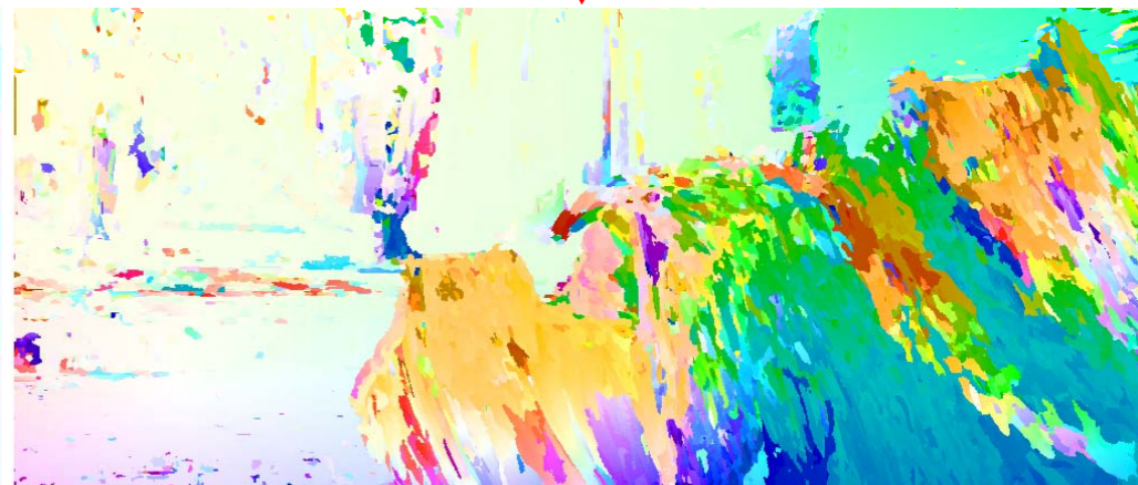
(a) Initial correspondence field