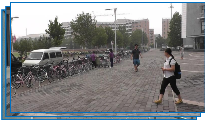
Cam 2, 3,...