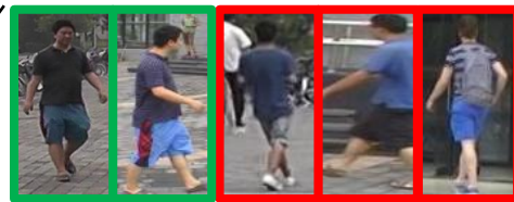
(b) Person Re-identification