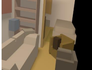
Annotated 3D Model (two views)